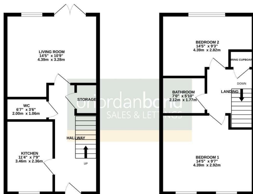
TOTAL FLOOR AREA: 775sq.ft. (72.0 sq.m.) approx.

While every attempt has been made to ensure the accuracy of the description contained here, measurements of doors, windows, rooms and any other items are approximate and no responsibility is taken for any error, omission or mis-statement. This plan is for illustrative purposes only and should be used as such by any prospective purchaser. The services, systems and appliances shown have not been tested and no guarantee as to their condition or efficiency can be given. Made with Metreapp 6/20/25